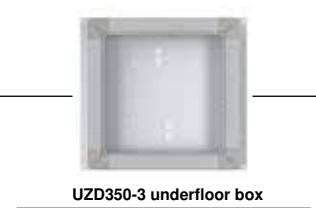
UZD350-3 underfloor box